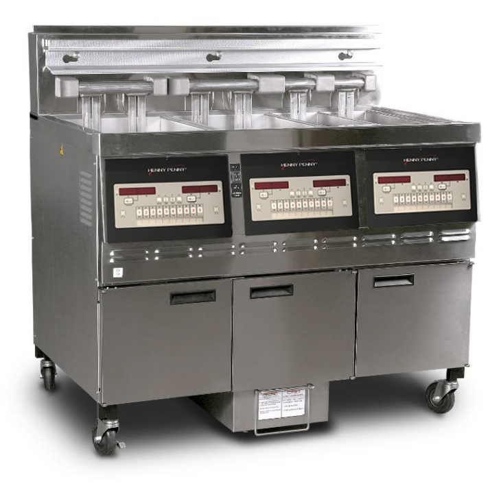
GVE 073 3-well manual low oil volume open fryer with two full vats and one split vat

GVE 071 1-well electric GVE 072 2-well electric GVE 073 3-well electric GVE 074 4-well electric